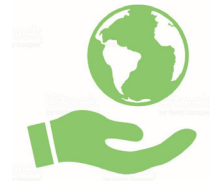
Corporate Culture and Social Responsibility