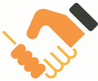
Honesty and Trust