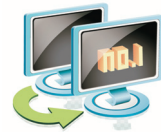
Technology and Innovations