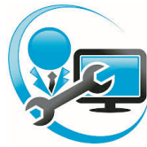
Experienced and well-equipped Staff